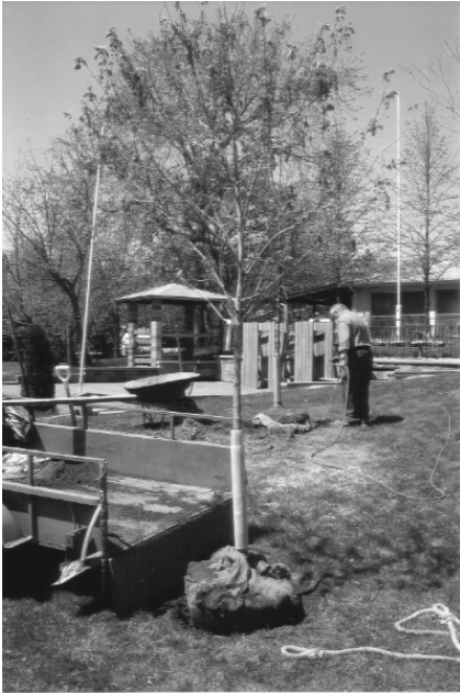
Planting trees by the Pavilion.