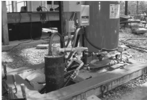
New water pressure tank and concrete footing.