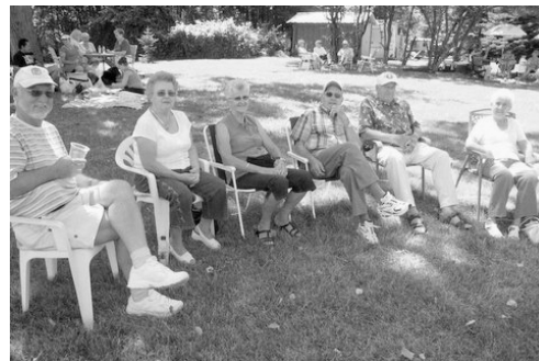
Enjoying the perfect Picnic weather!