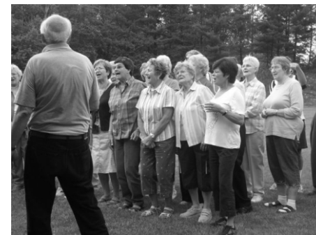
The Choir sings