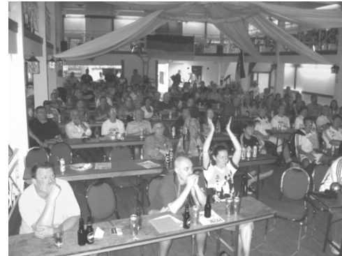
Cheering Germany during the Euro2008 at the Germania Club.