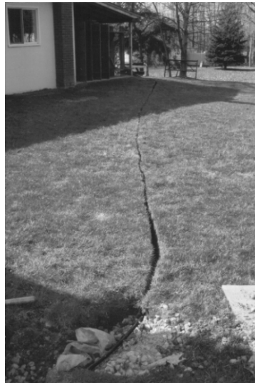
Water line placed to the pavilion.