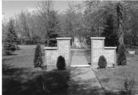
New shrubs by the Memorial.