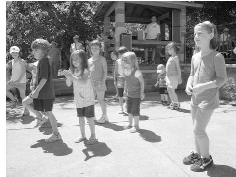
Children participating at the Germania Club Picnic

P.S. I will not write for September and October due to a knee operation. Wish me luck. Somebody will keep you informed about events. Helga