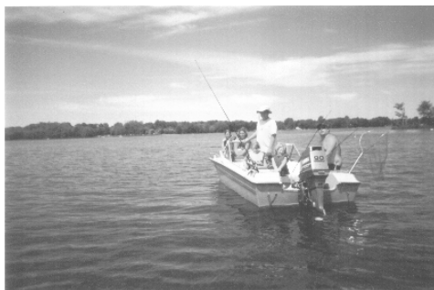
Fishing at Lake Dalrymple. From a boat or on the dock the pleasure is the same!