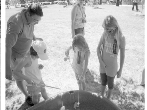
Doing some fishing at the Fisher and Hunters Carnival booth.