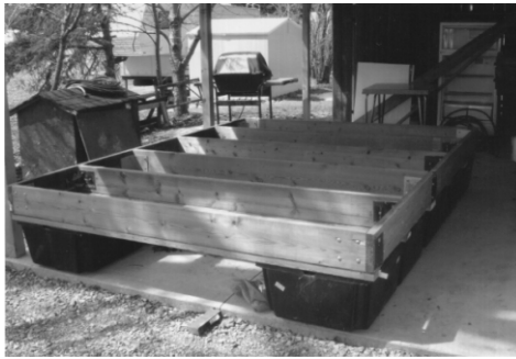
Floating dock construction.