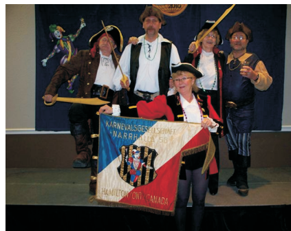
Narrhalla in Las Vegas